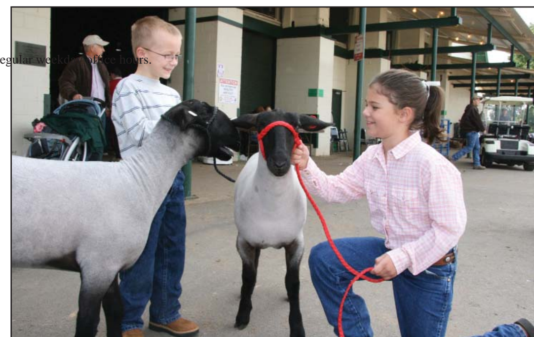
These competitors at the N.C. State Fair were all smiles before entering the show ring.