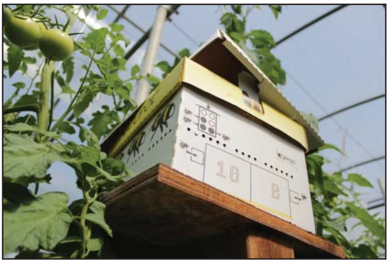
We may be familiar with seeing bees outside around plants, but these insects even work inside. A farmer in Harnett County uses bees inside his greenhouse to pollinate tomato plants and other vegetables.

Several NCDA&CS divisions are actively involved in increasing habitat and support-